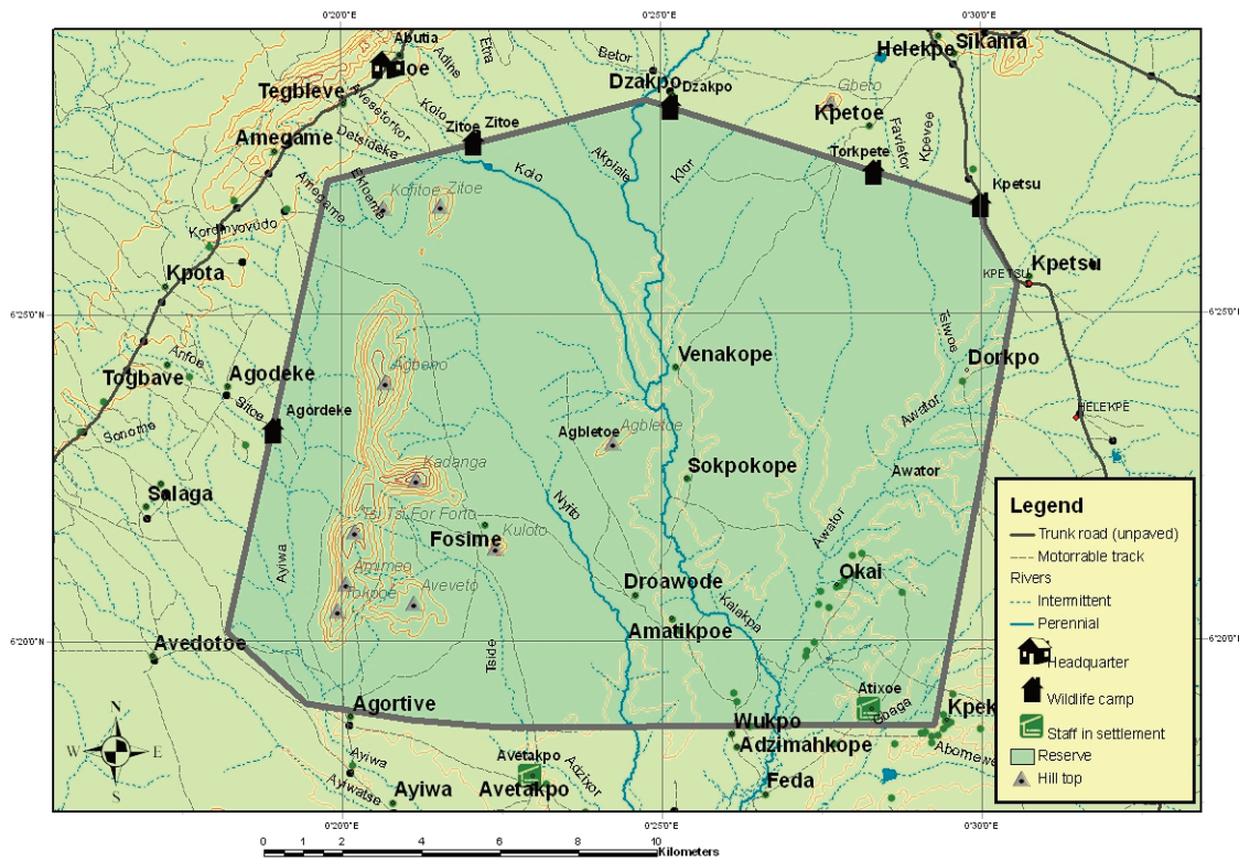
Figure. Map of Kalakpa Resource Reserve (courtesy of Theo van der Sluis, SNV, Ho).