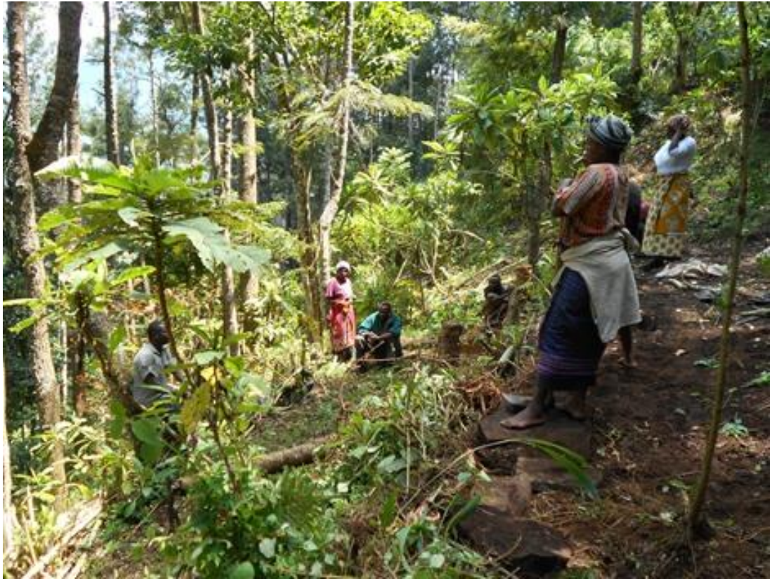
Figure 2: Training on tree-planting at Yale site