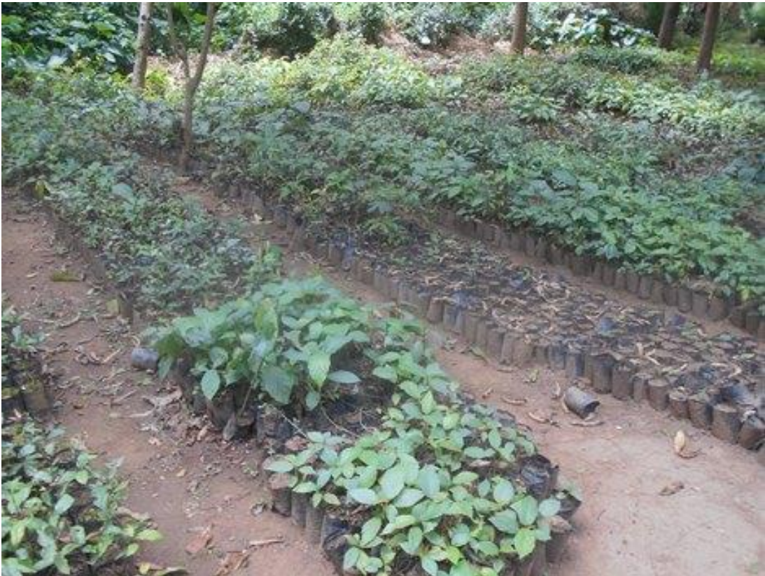
Figure 5: Tree nursery at Ngangao site 2