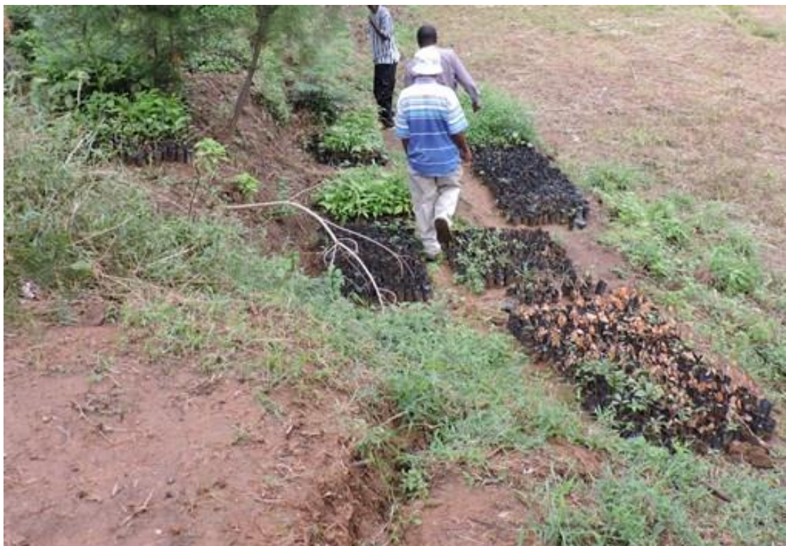
Figure 3: Tree nursery at Yale site. Most seedlings died due to drought.