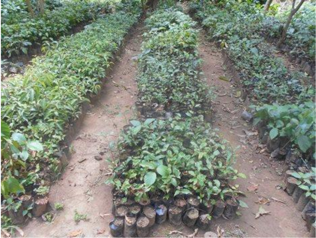
Figure 4: Tree nursery at Ngangao site 1