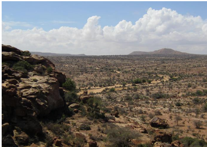
View over wadi from Las Geel site

Located about 60 kms ENE of Hargeisa, the Las Geel caves are an important archeological site for its remarkable rock paintings dating from around 7000 BC. They are easily accessible from town (about 1 hr drive, last 5 km on dirt track) but access needs to be arranged beforehand as a permit from the Ministry of Tourism is required. Two hours spent at Las Geel produced a good number of additional species, with several singing Arabian Warblers, Black-throated Barbet, and Booted Eagle being the highlights there, plus two Magpie Starlings along the road on the way back to town – and much better sound-recording conditions than the previous day. I only explored the area between the archeological site and the wadi but one could easily spend half a day in this location.