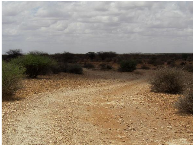
Road near Xadhig-Xadhig

We set off at 5.40am for our day trip and did a loop starting from the airport area towards the SE, then turning west onto the Qool-Caday plain (see map 1). This site, also spelled Qoladay or Kool Adey, is known for Golden Pipit (during/after rains), larks and bustards but since it was mid-afternoon by the time we reached the plain and because of pretty windy (and sandy!) conditions we didn't spend much time here. We weren't after any particular species but I was generally keen on recording songs and calls of some of the local "specials". Most birding was done during opportunistic stops along the road, and quite a few species were spotted while driving on the tracks – most of which allow for a speed max. 20 to 30 km/h only; only the last 20 km of the loop is on tarmac road. Return to Hargeisa around 7.30pm.