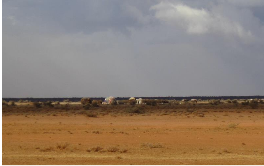
Settlement on the Qool-Caday plain