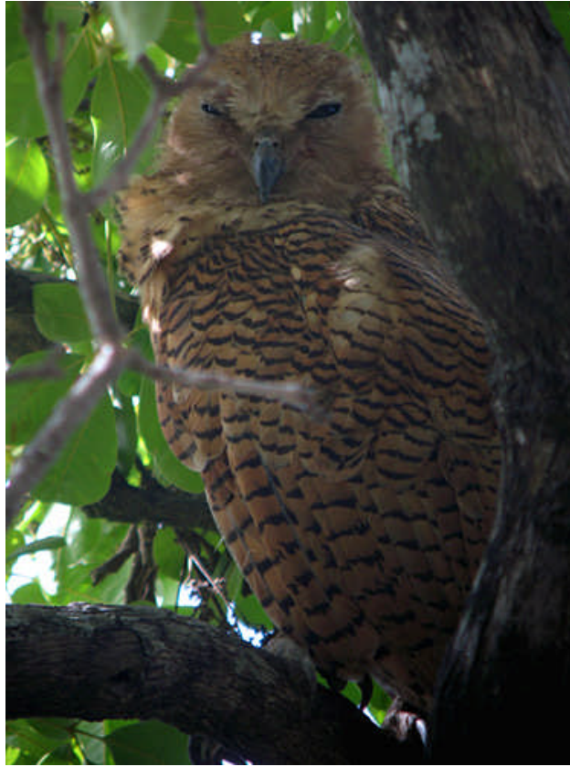
Pel's Fishing Owl Mole National Park