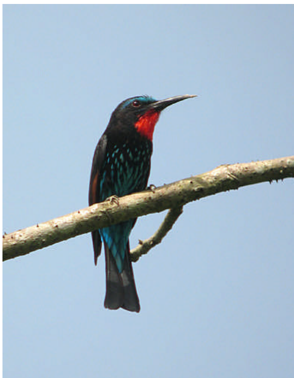
Black Bee-Eater Sam Woods Kakum National Park

The trip far exceeded our guest's expectations with 405 species in 16 days a record for Ghana birdwatching. Aside this the couple chasing the BIGGEST TWITCH also added more than 200 new species to their record attempt list, impressive as they had already birded in Ethiopia before coming to Ghana. Their top 5 species were the Yellow Headed Picathartes, Pel's Fishing Owl, Chocolate Backed Kingfisher, Standard winged Nightjar and Black Bee- eater.