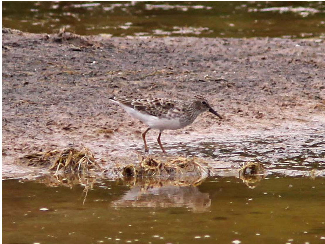
Fig. 21. Calidris minutilla , Rabil lagoon, Boavista, 15 April 2009 (Richard Ek)