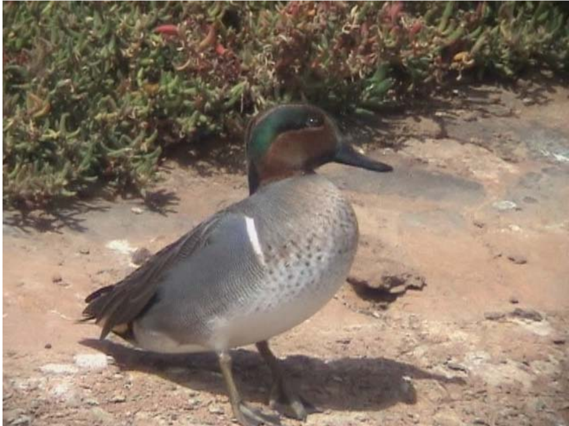
Fig. 4. Anas carolinensis , sewage ponds, São Vicente, 13 January 2005 (Dick Forsman)