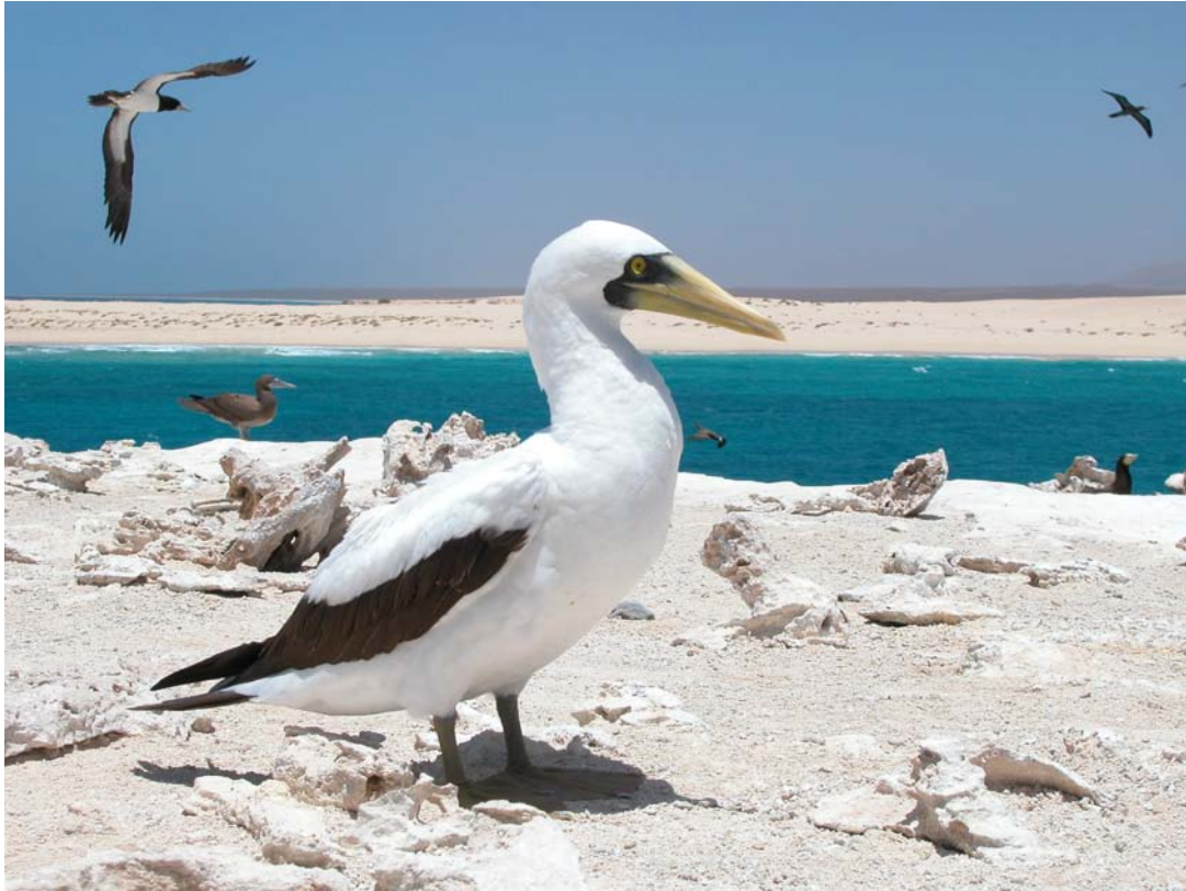
Fig 9. Sula dactylatra , Ilhéu de Curral Velho, Boavista, 22 April 2005