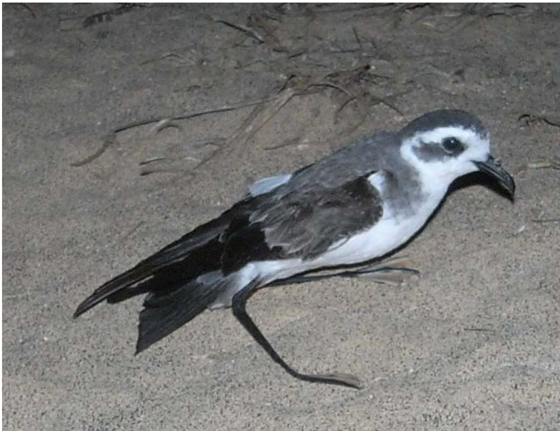
Fig 1. Pelagodroma marina , Laje Branca, Maio, 16 April 2009

endemic taxa, new or rare records for a particular island, as well as other noteworthy observations.