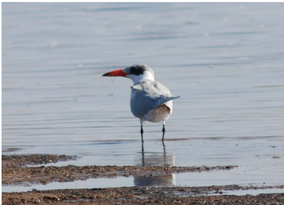
Fig. 28. Sterna caspia , saltpans, Maio, 15 November 2007