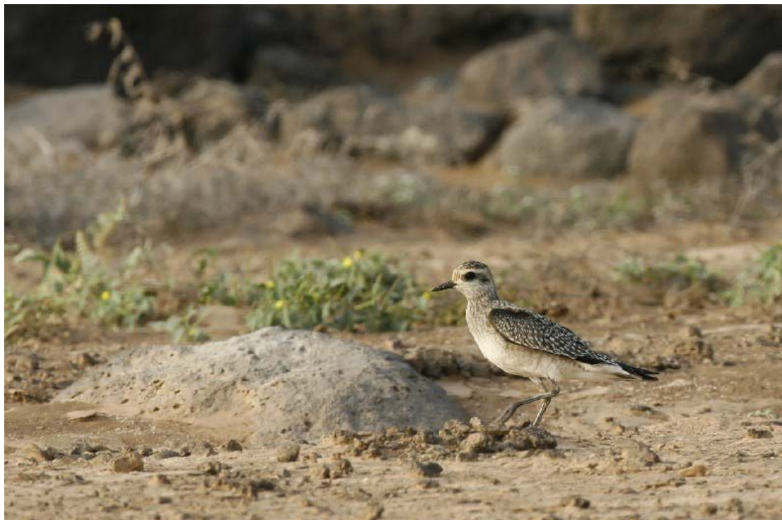
Fig. 20. Pluvialis dominicus , Raso, 21 October 2006