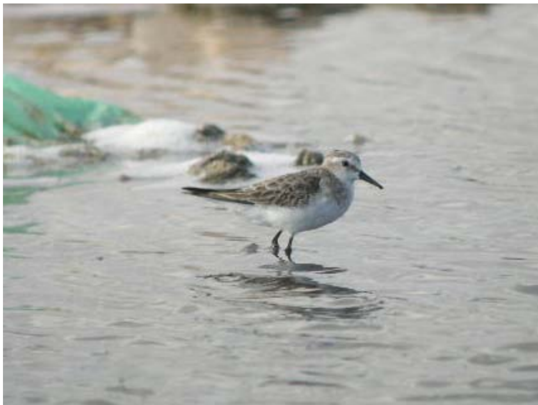
Fig. 23. Calidris bairdii, Santa Maria, Sal, 20 October 2007