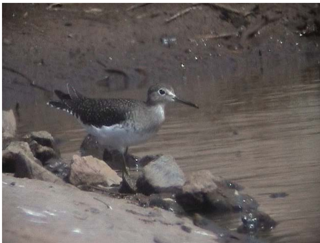
Fig. 26. Tringa solitaria , sewage works, São Vicente, 13 January 2005