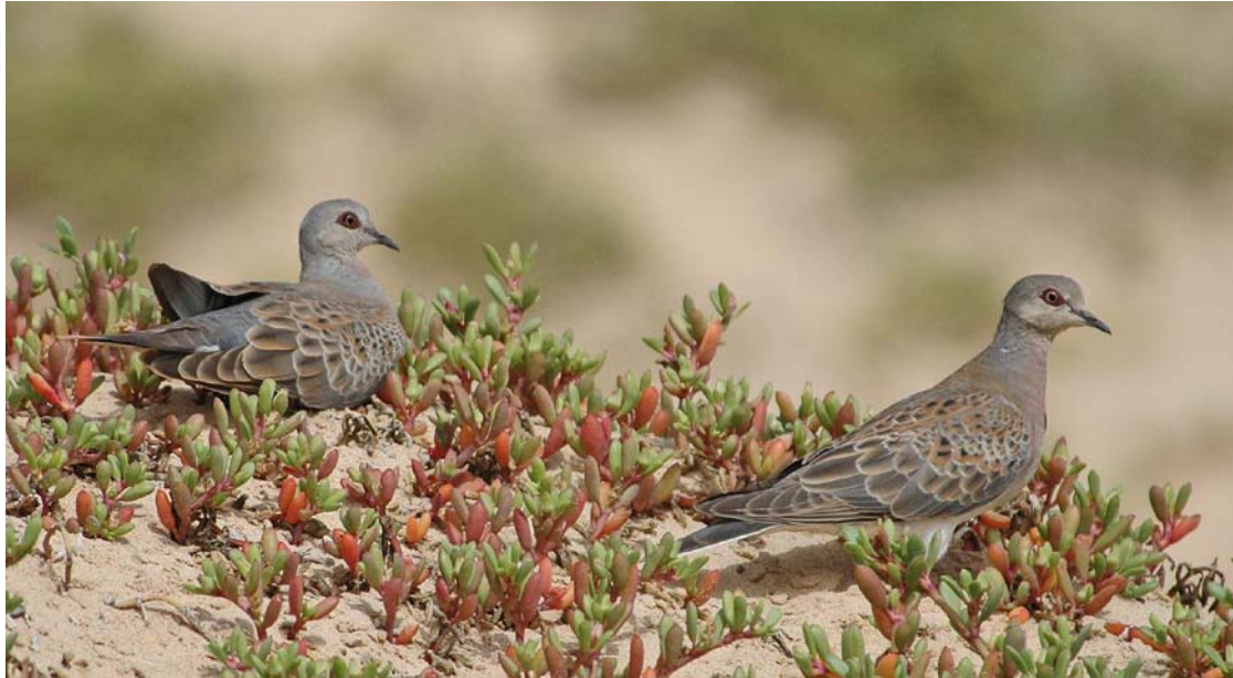
Fig. 31. Streptopelia turtur , Santa Maria, Sal, 17 September 2007 (Robin Brace)