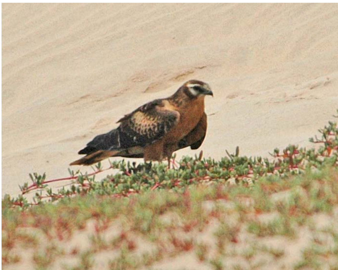
Fig. 16. Circus pygargus , Santa Maria, Sal, 16 September 2007 (Robin Brace)