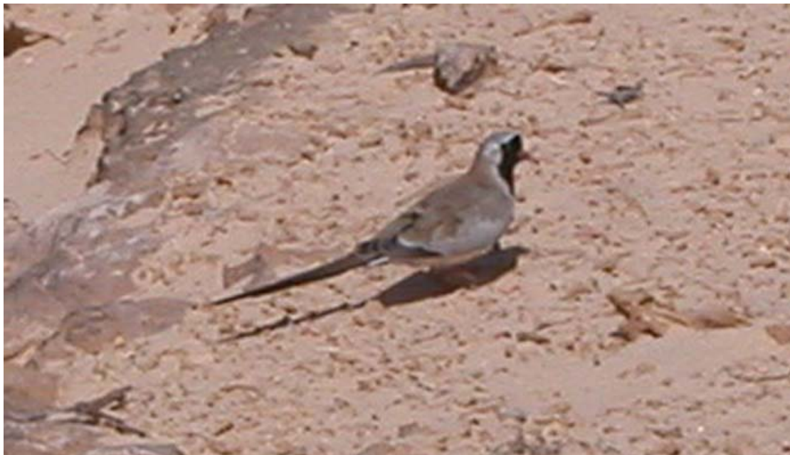
Fig. 30. Oena capensis , Ponta de Varandinha, Boavista, 2 December 2006 (Pedro López Suárez)

(0, 2) BOAVISTA: a male at Ponta da Varandinha, 2 December 2006 (PLS). This is the second record of Namaqua Dove, a common resident and intra-African migrant in the Sahel zone, the previous being of one on Maio, 21 July 1995.