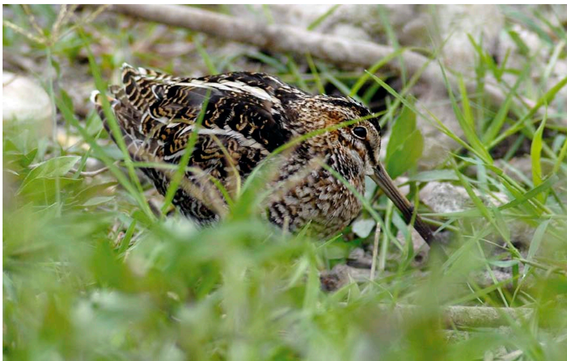
Fig. 24. Gallinago delicata , Barragem de Poilão, Santiago, 26 March 2007 (René Pop)