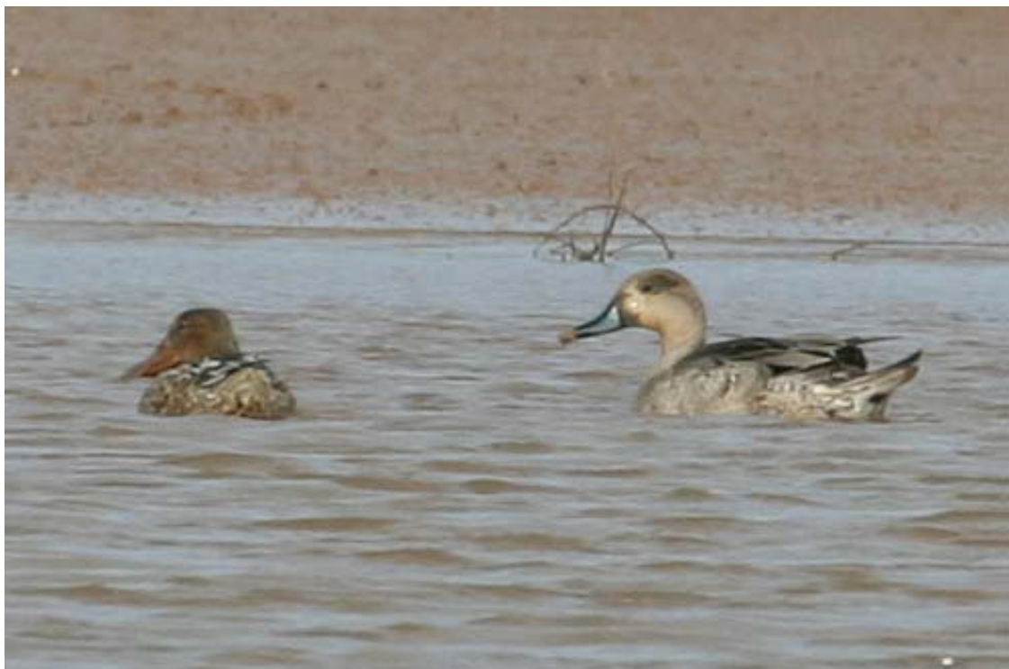
Fig. 5. Anas clypeata and A. acuta , Ribeira da Madama, Sal, 4 December 2008 (Simon Tickle)