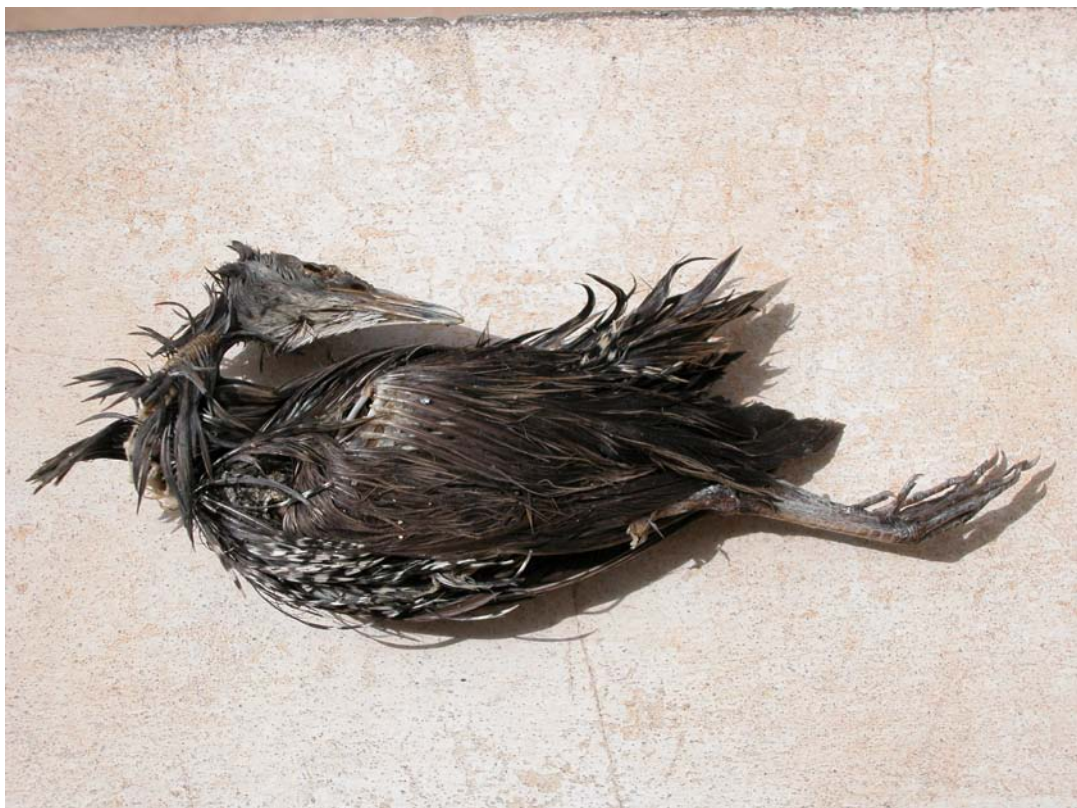
Fig. 18. Crecopsis egregia , found at Ilhéu dos Pássaros, Boavista, 4 February 2004 (Pedro López Suárez)