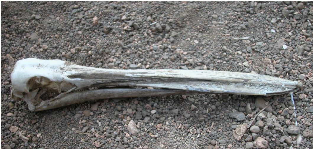
Fig. 11. Pelecanus onocrotalus , found at Olho do Mar, Boavista, 12 September 2007 (Pedro López Suárez)

possibly, the bird present on Santiago in March moved to Boavista later on, but as there is no certainty about this, each island record is counted separately. These are the first records of White-breasted Cormorant since 1924. There are scanty 19 th Century records, lacking in detail, from São Vicente, Raso, São Nicolau and Boavista. The single 20 th Century record is of an immature female collected on Boavista, 17 March 1924. P. lucidus is a locally common breeding bird from Mauritania to Guinea. Although considered resident, some dispersal evidently takes place, as demonstrated by the 2007 Cape Verde records.