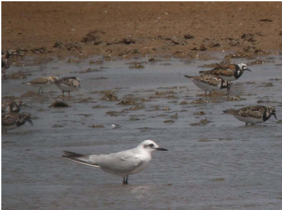
Fig. 27. Gelochelidon nilotica , Ribeira da Lagoa, Maio, 19 April 2009

(0, 3) BOAVISTA: 1-2 at Sal Rei and Rabil lagoon, 24-25 December 2000 (TD). Royal Tern has been recorded (December, February-April) from Sal (1), and Boavista (2). Possibly, the record of three long-staying birds at Rabil lagoon, Boavista, 16 March-23 April 2001 (cf. Hazevoet 2003), concerned the same party as those reported here.