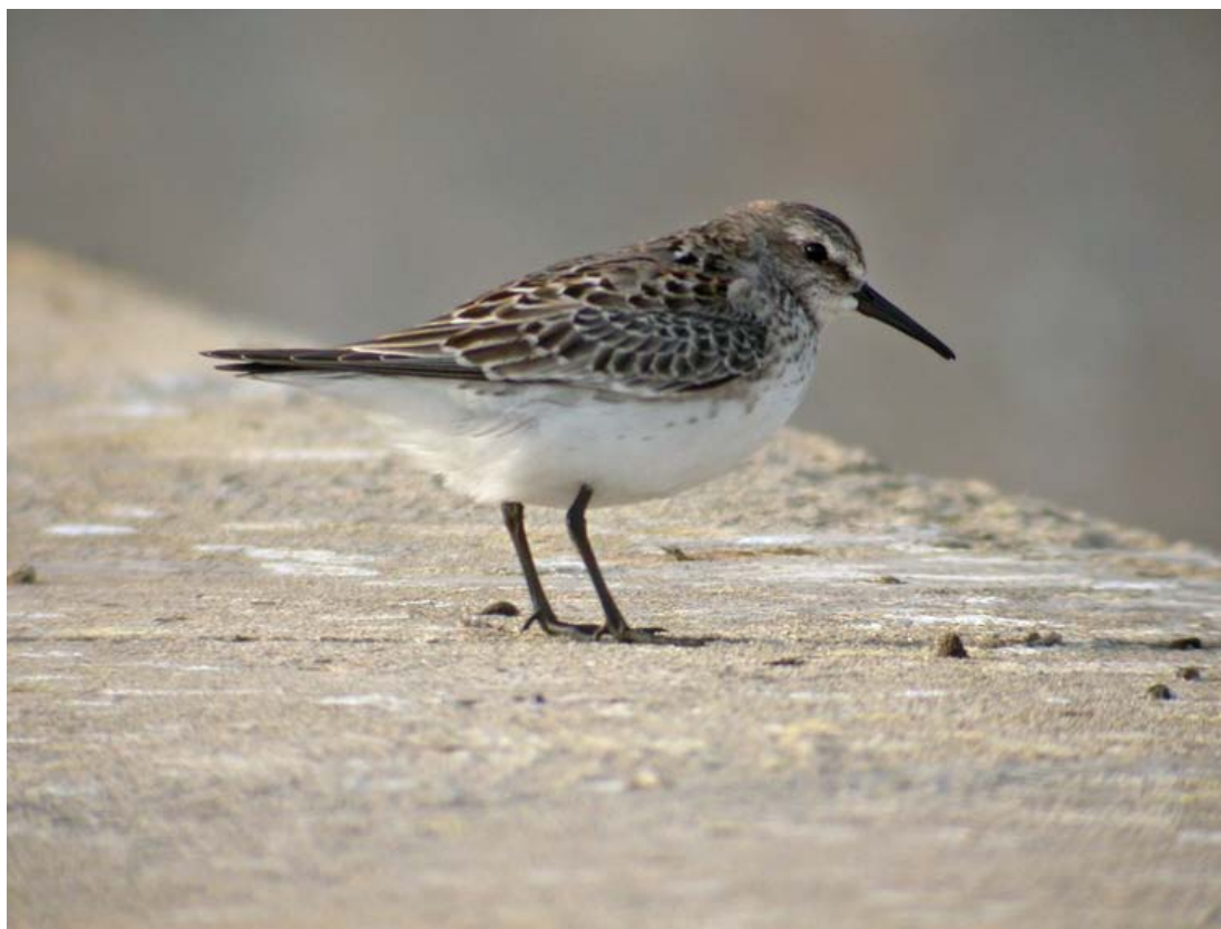
Fig. 22. Calidris fuscicollis , sewage works, São Vicente, 3 November 2005 (Kris De Rouck)