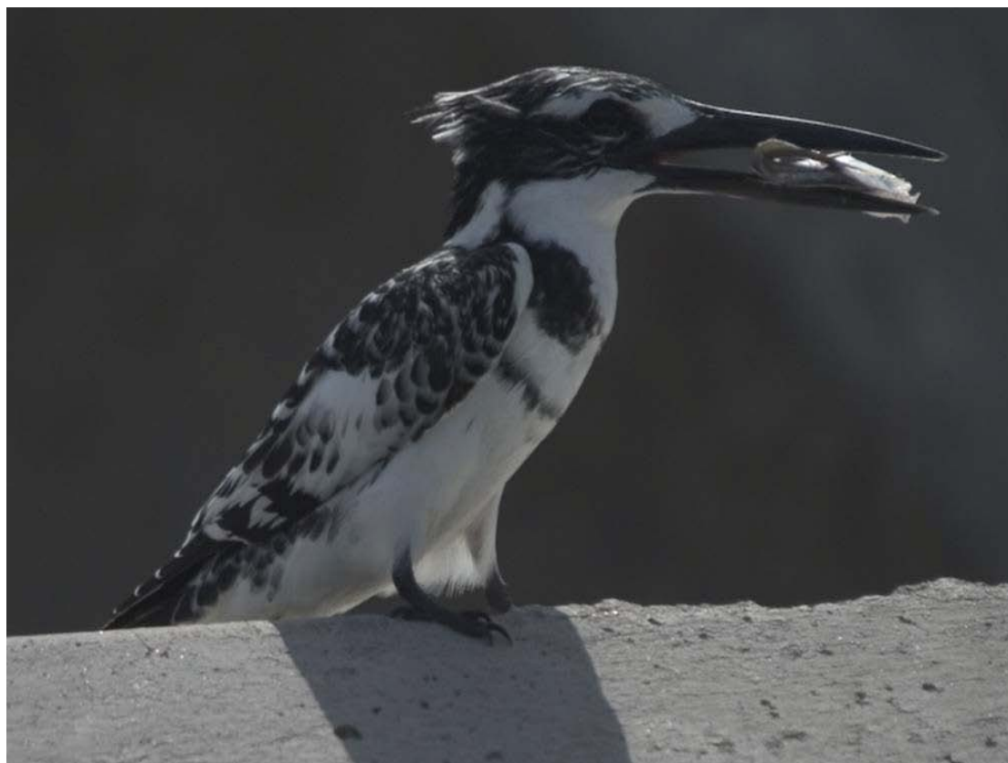
Fig. 32. Ceryle rudis , São Filipe, Fogo, 19 October 2004