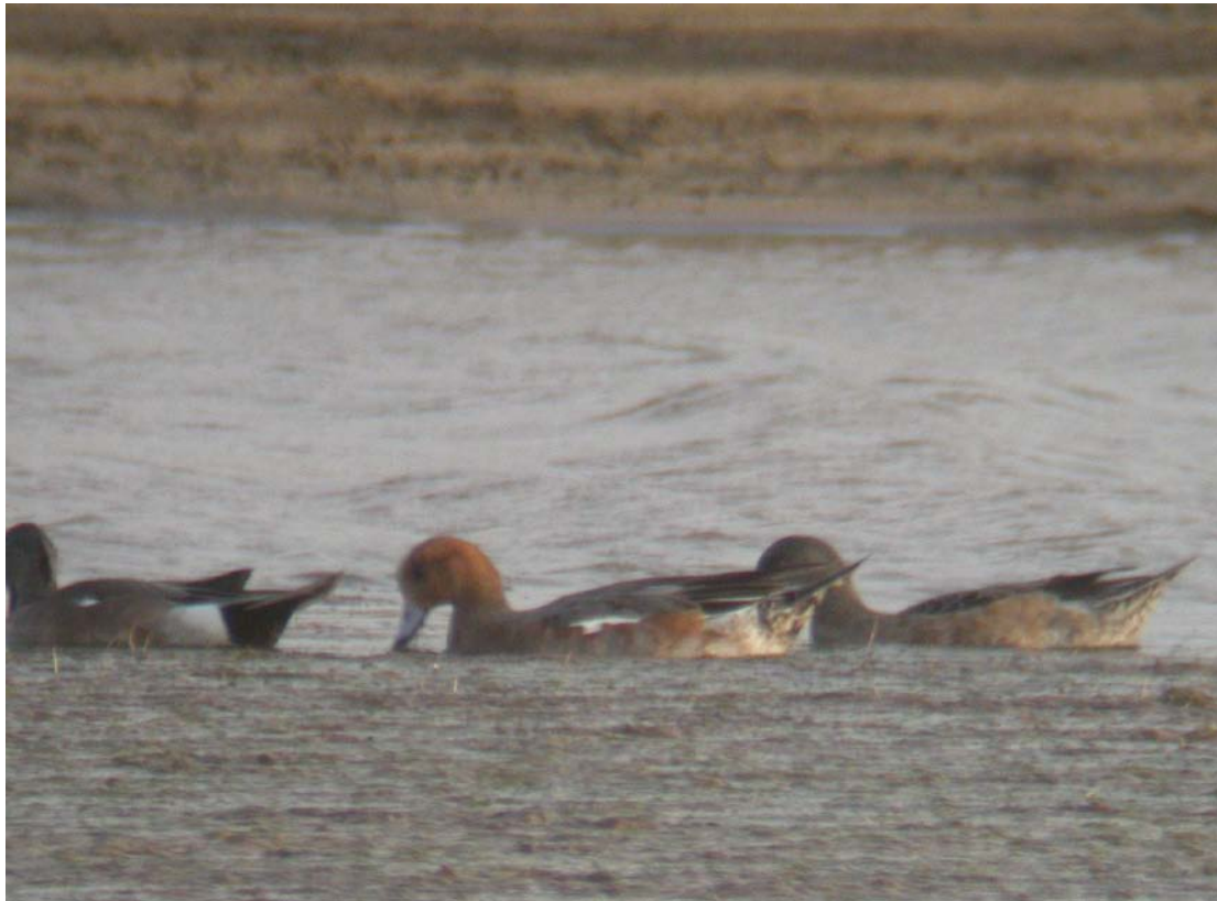
Fig. 3. Mareca penelope and M. americana, Casas Velhas, Maio, 1 January 2005