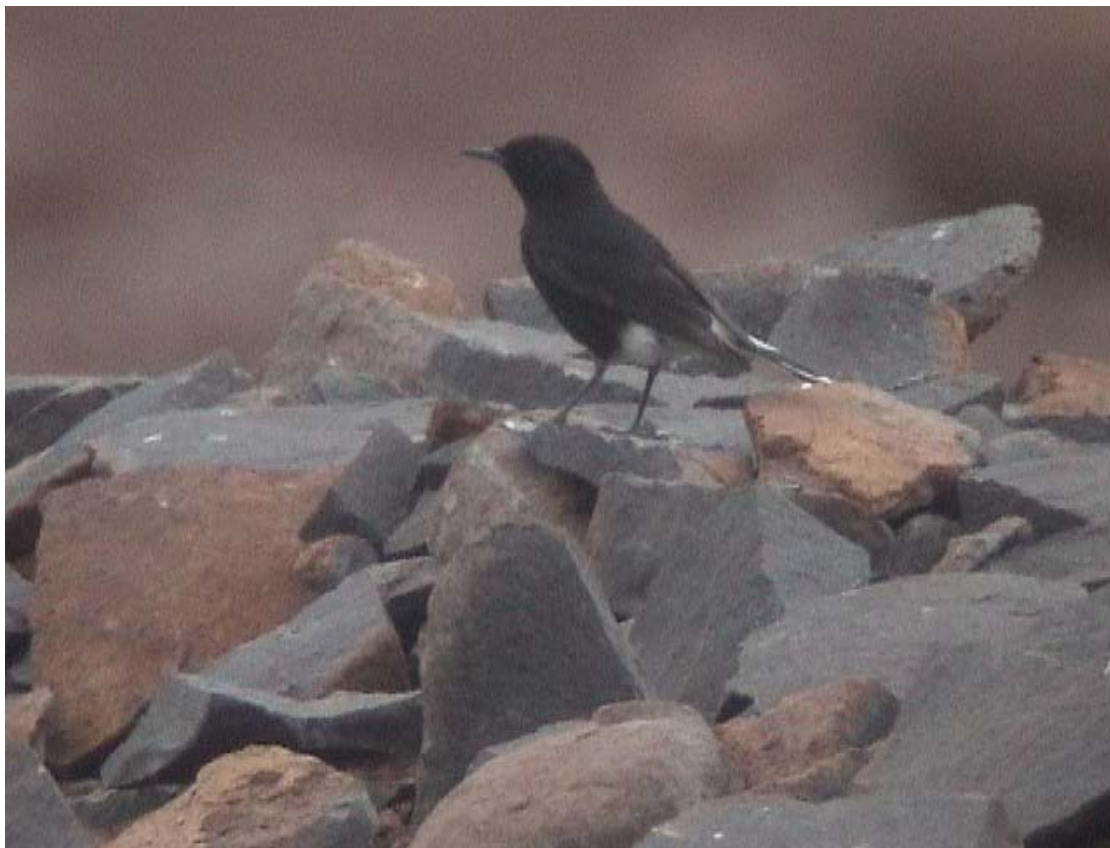
Fig. 36. Oenanthe leucopyga , Cidade Velha, Santiago, 16 January 2005 (Dick Forsman)