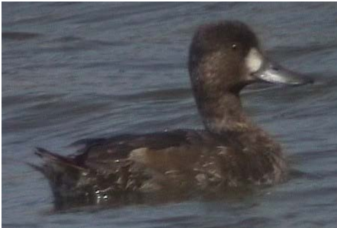
Fig. 6. Aythya affinis , sewage ponds, São Vicente, 13 January 2005 (Dick Forsman)

(0, 3) SÃO VICENTE: two females at the sewage ponds, 12 March 2003 (RP), and again two females there, 10-20 December 2007 (YBa, CGr). Ring-necked Duck has been recorded (November, December, March) from São Vicente (2) and Sal (1).