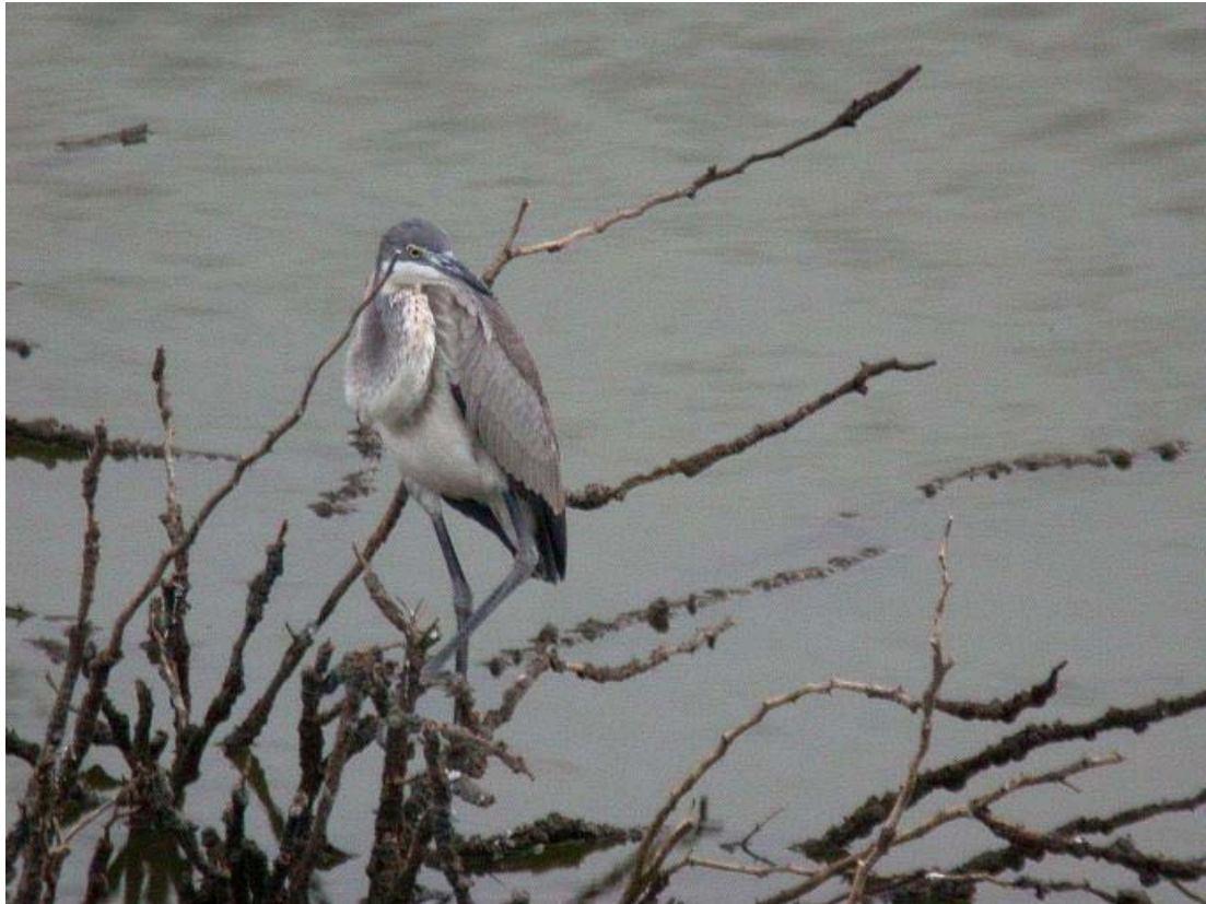
Fig. 14. Ardea melanocephala , Barragem de Poilão, Santiago, 21 March 2009 (Cor Hopman)

American origin. The only previous record of Great Egret was of one on Boavista, 9 March 1999.