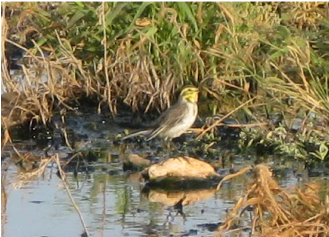
Fig. 35. Motacilla citreola , Santa Maria, Sal, 10 January 2008 (Tim Collins)

7-10 January 2008 (CGr), and again two there, 1 March 2008 (HK). Red-throated Pipit has been recorded (December-March) from São Vicente (3), and Sal (3).