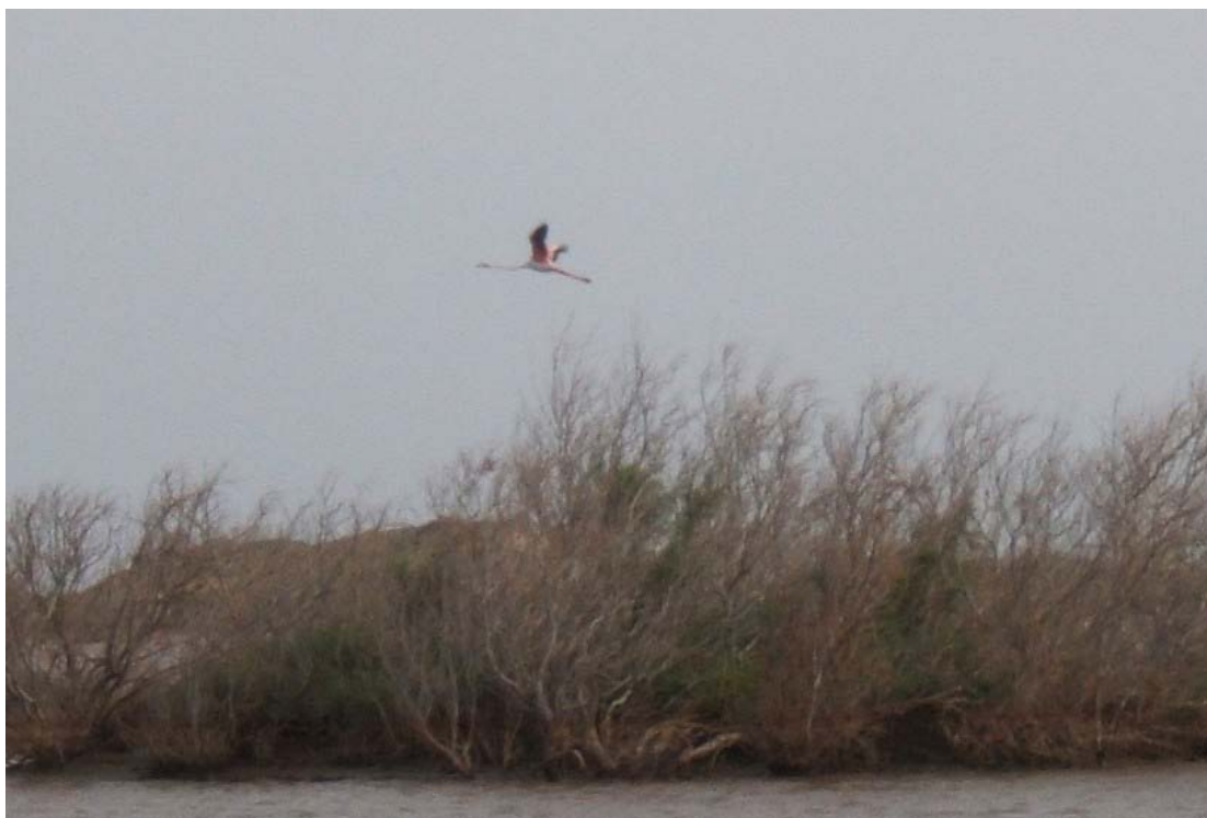
Fig. 15. Phoenicopterus roseus , João Barrosa, Boavista, 17 October 2008 (Saray Jimenez Bordón)