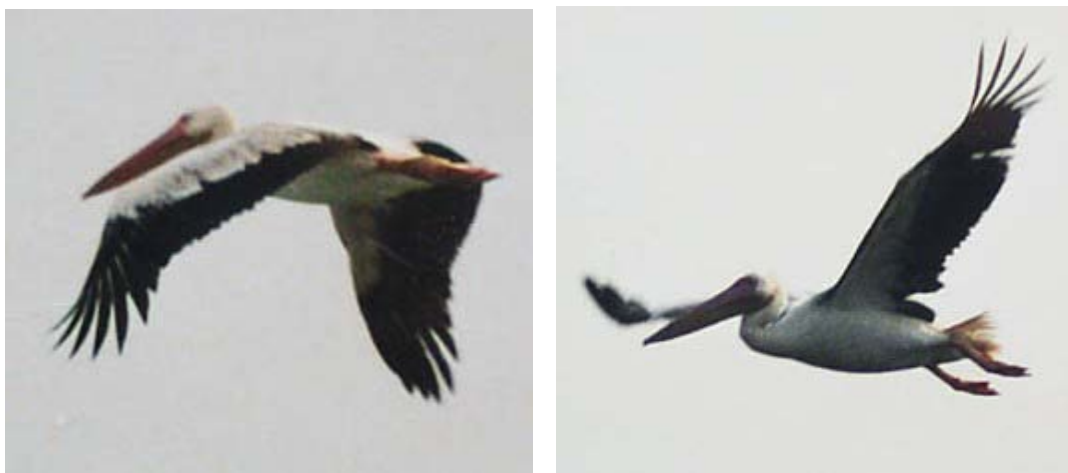
Fig. 12-13. Pelecanus onocrotalus , Sal Rei, Boavista, July or August 2000