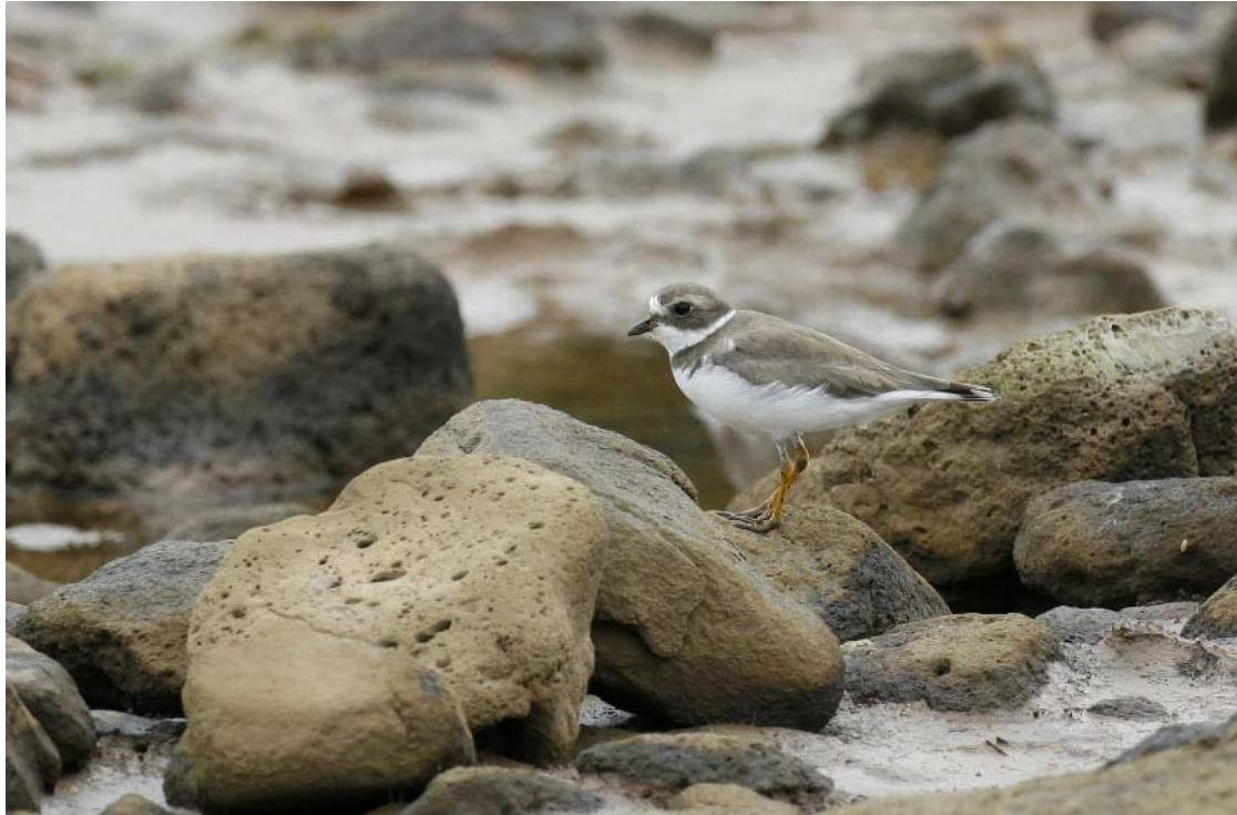
Fig. 19. Charadrius semipalmatus , Tarrafal, Santiago, 17 October 2006