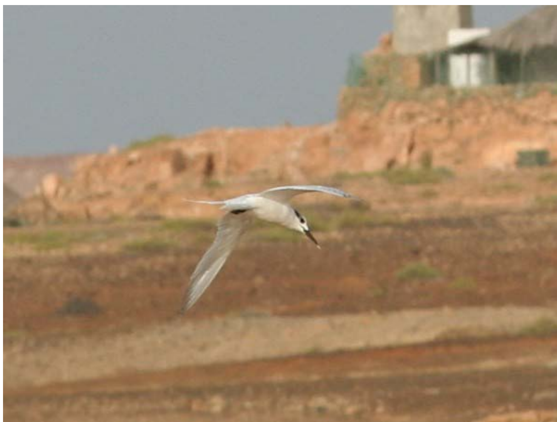
Fig. 29. Sterna sandvicensis , Ribeira da Madama, Sal, 4 December 2008