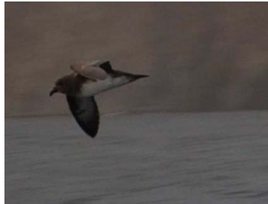
Fig. 7-8. Pterodroma arminjoniana , off southern Brava, 30 September 2008