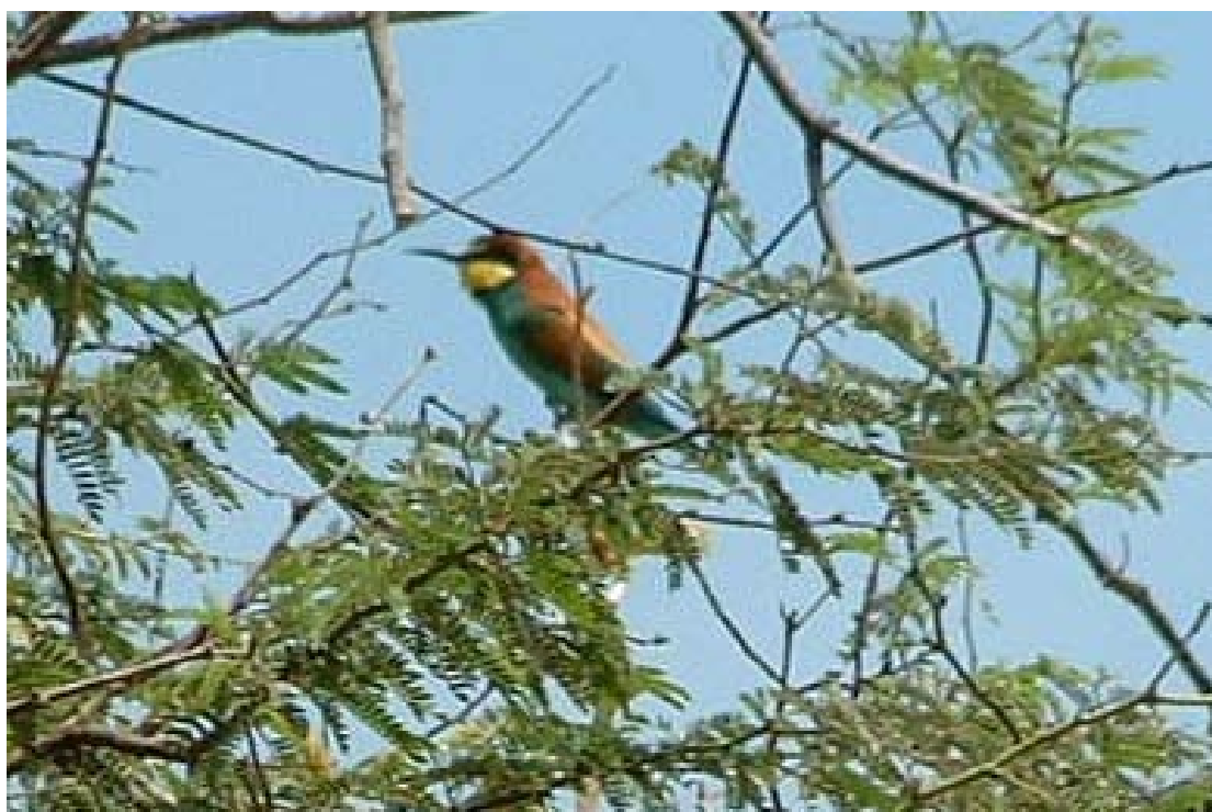
Fig. 33. Merops apiaster , João Barrosa, Boavista, 7 April 2006