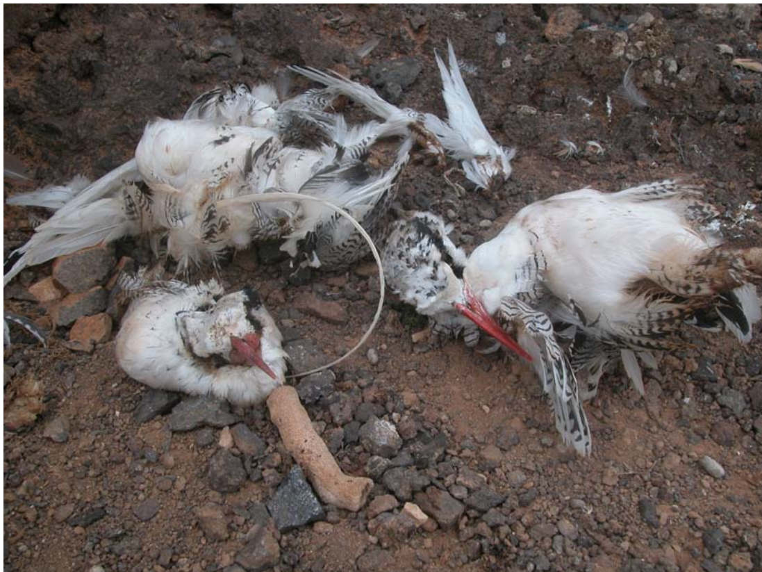
Fig. 2. Phaethon aethereus , victims of vandalism, Boavista, 5 March 2007 (Pedro López Suárez)

The records from Ilhéu dos Pássaros, São Vicente, are the first there in recent times and an inspection of the islet – situated at the entrance to the main port of Cape Verde and thought to be devoid of seabirds since the mid-19 th century – is warranted. The tropicbirds at Ponta do Sol, Boavista, suffer from predation by both humans and feral cats, while on Raso (a Nature Reserve by law) human destruction of tropicbirds is rampant. No recent counts of breeding sites on Brava and Ilhéus do Rombo are available.