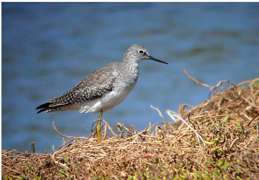
Fig. 25. Tringa flavipes , sewage ponds, São Vicente, 1 February 2007