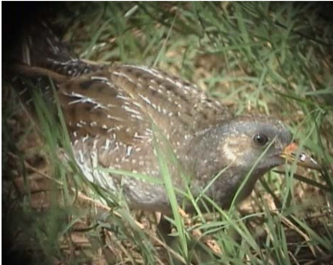
Fig. 17. Porzana porzana , sewage works, São Vicente, 13 January 2005.